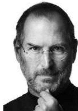
Steve Jobs by Walter Isaacson

Texto adaptado de: https://www.studyguidezone.com/reading-comprehension-worksheet.htm